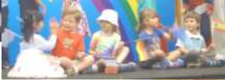
PETROVIC Music Through the Decades