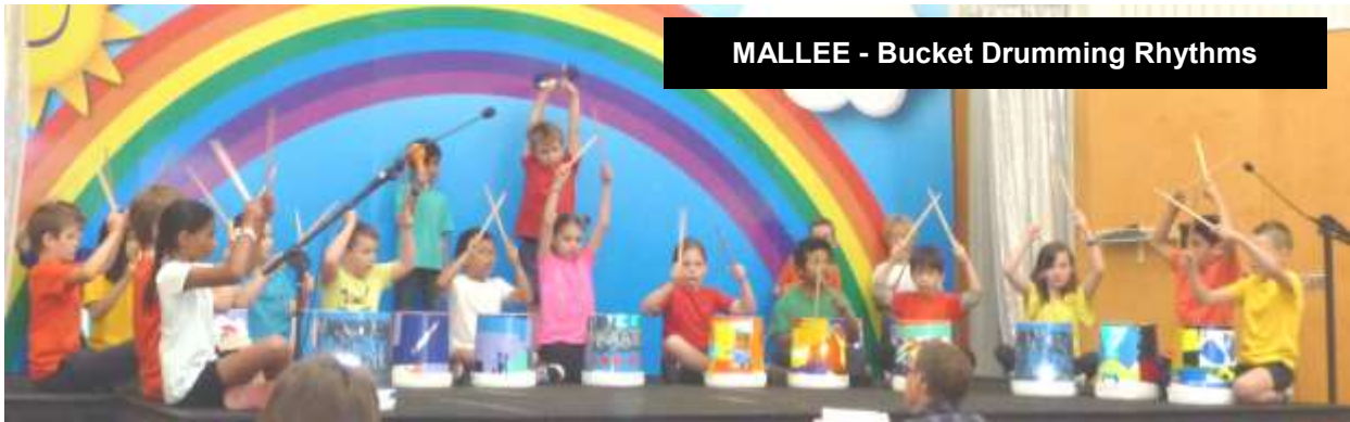
MALLEE - Bucket Drumming Rhythms