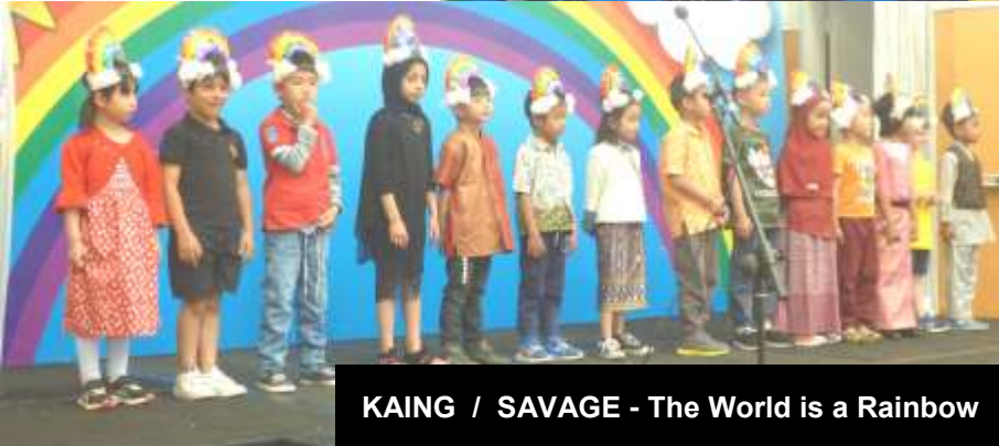
KAING / SAVAGE - The World is a Rainbow