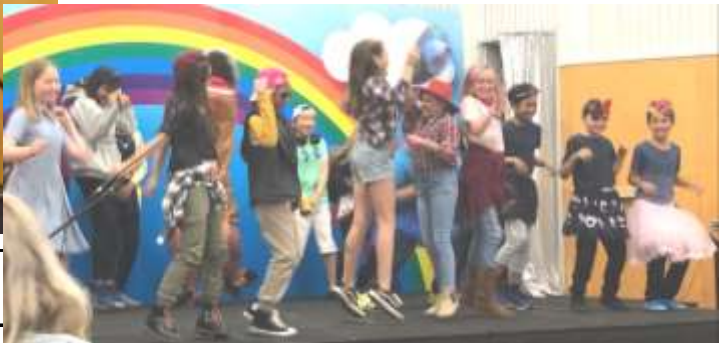
DURDIN - Bellevue's Best Beats