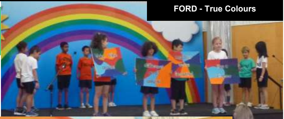
FORD - True Colours