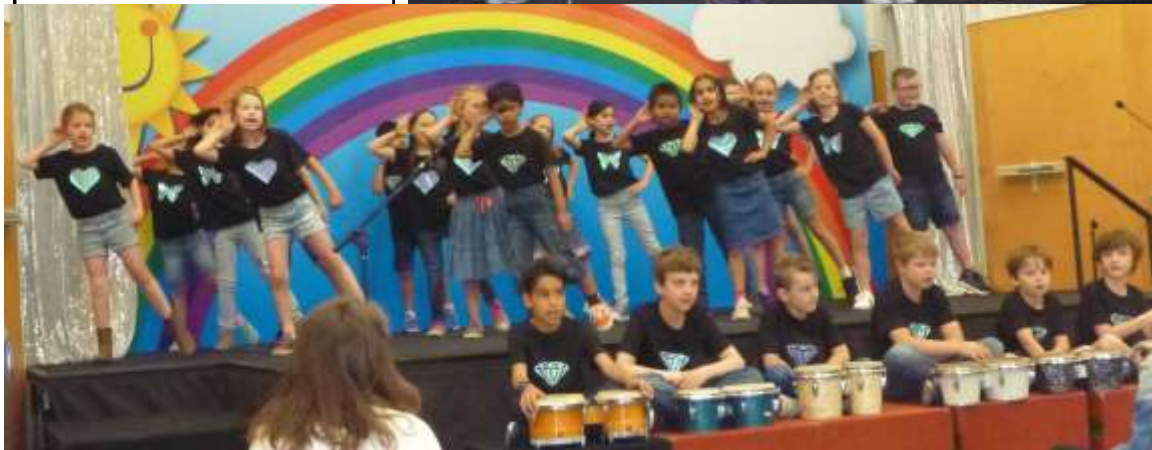
SPELLS / MAIN Beauty in the World