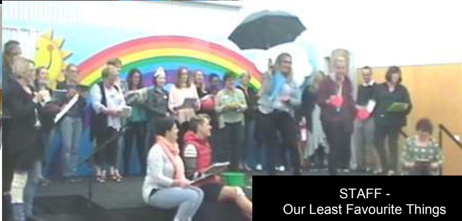
STAFF - Our Least Favourite Things